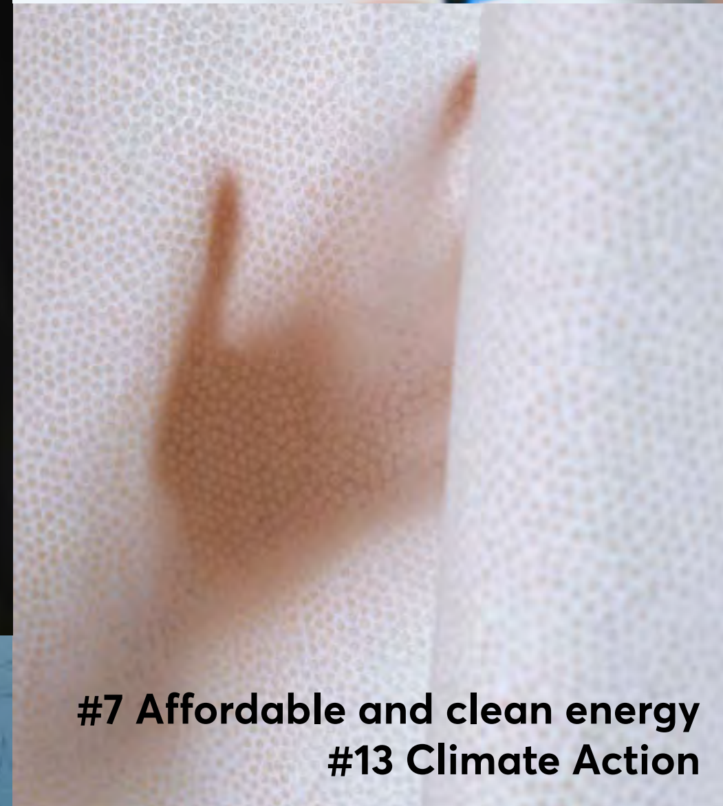
#7 Affordable and clean energy #13 Climate Action