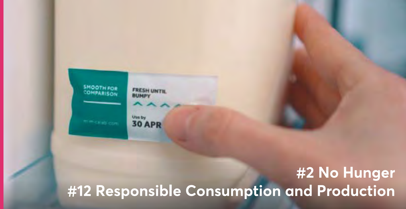
#2 No Hunger #12 Responsible Consumption and Production