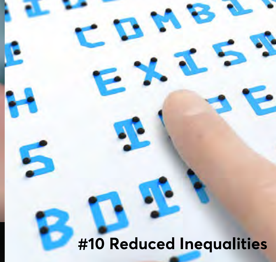
#10 Reduced Inequalities