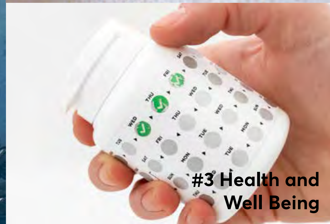
#3 Health and Well Being

The SDGs form a blueprint that has underpinned the whole programme since its inception in 2017. From how to combat food waste, to alleviating the burden of remembering to take chronic medications and building connections between the sighted and visually impaired, antenna gives these innovative thinkers a soapbox from which to ensure that their fresh ideas hit fertile ground.