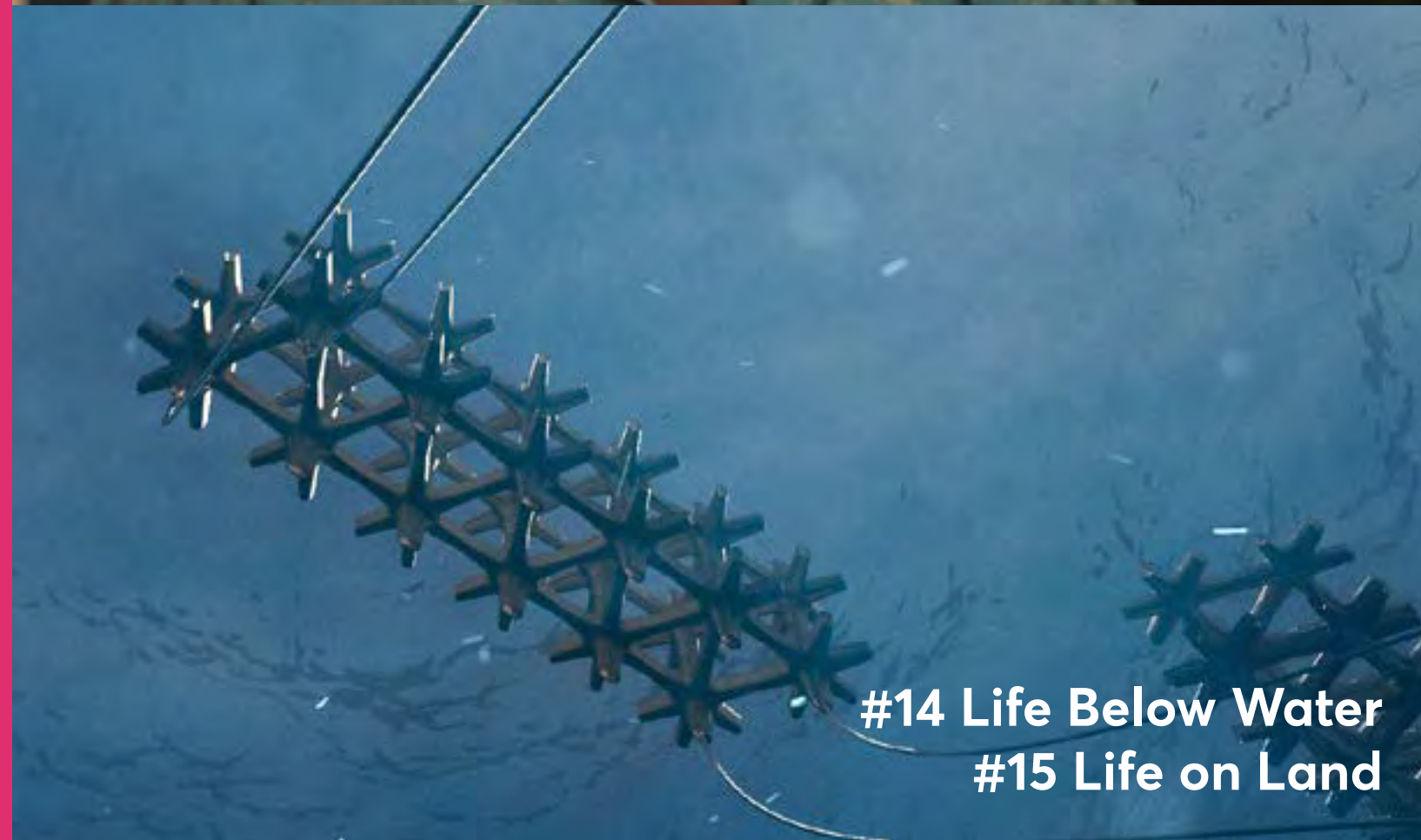
#14 Life Below Water #15 Life on Land