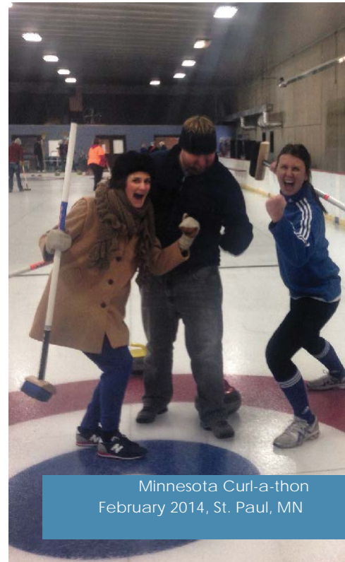
Minnesota Curl-a-thon February 2014, St. Paul, MN